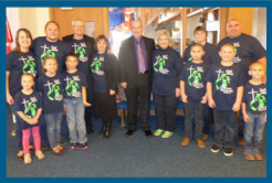
Missions Conference Wick Rd. Baptist, Taylor, MI