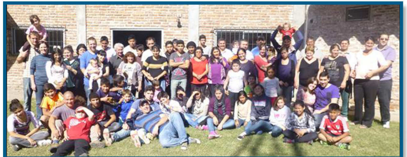
Easter retreat in Buenos Aires, Argentina