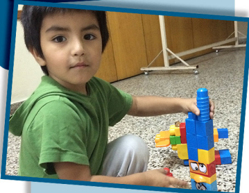
Once again, thank you to all who donated toys for the nursery. The children are enjoying them!