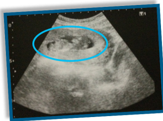
Our first ultrasound at 12 weeks. Baby is growing well!