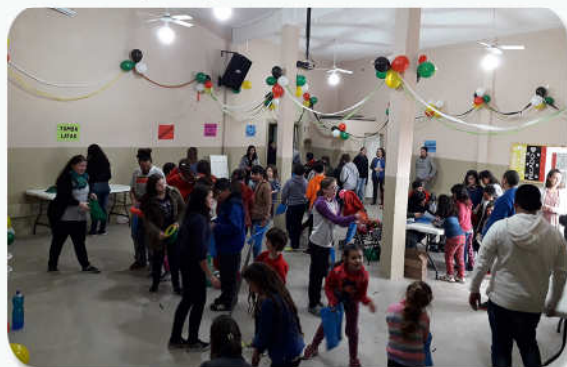
Children's Day 2017