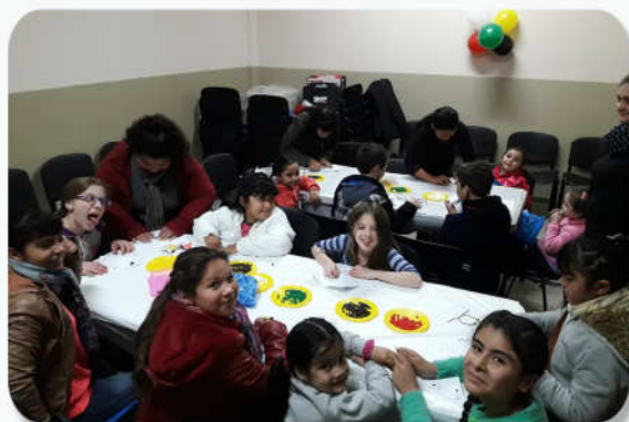
Children's Day 2017